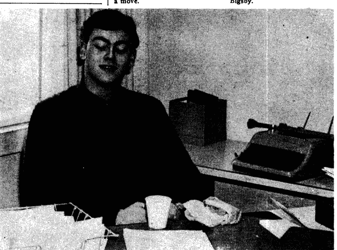
Bigsby — Student Intellectualism

Let's have a sit-in and show the council who is boss and who calls the tune on this campus.